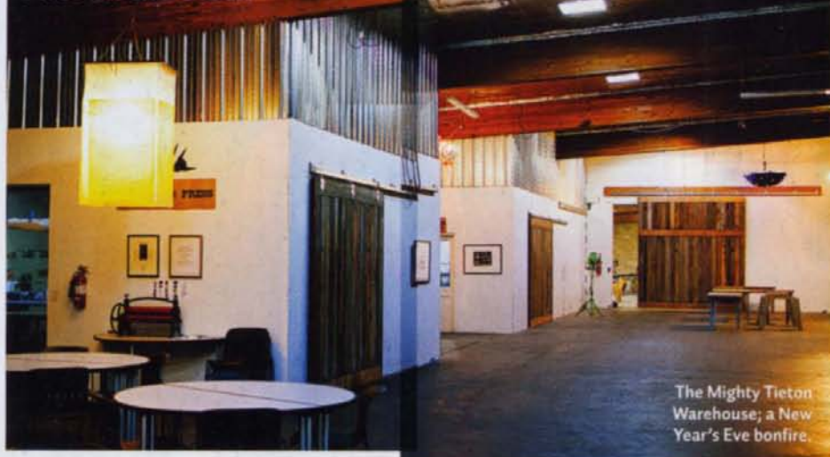
The Mighty Tieton Warehouse; a New Year's Eve bonfire.